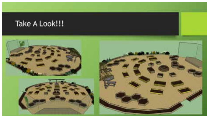
Hawkwood Community Garden plan- Rebecca O'Neill & Cheryl Moller