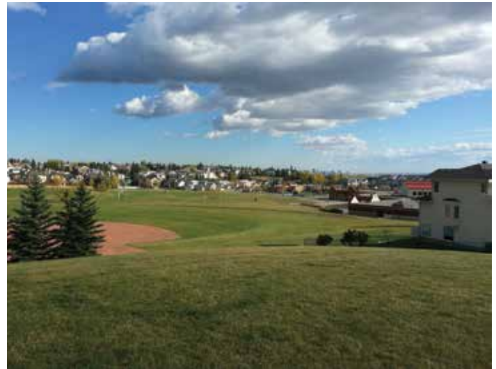
Proposed scenic bench location

To move these projects forward, volunteers are required for planning, finding funds, or stakeholder consultation, with HCA guidance. If scenic benches or biking/